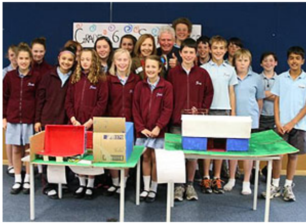
Forth Primary School students