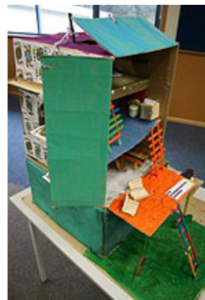
3-story model with passageways