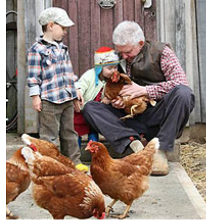
Appin Hall chooks