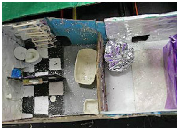
Bathroom with secret passage