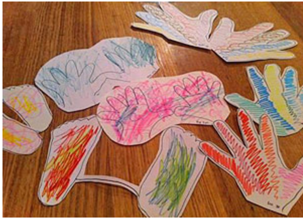
Art and Free time

Appin Hall can only meet its enormous yearly commitments because of the wonderful group of supporters, donors, volunteers, community organizations and business people who continue to step up to help our cause. Many community groups (Rotary, Lions, church etc) book in for Working Bees, and, in the process, invite young people (10 to 21 yr old) to participate in essential garden chores and site safety. Having young folk take a keen interest enables them to understand the shared vision – along with giving of themselves to help children/families less fortunate in our communities. It is a delight to see them working along side adults and expanding their social awareness within society.