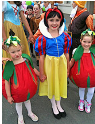
Snow White and two poison apples (Appin Hall exhibit) Launceston Christmas Parade

above. In order to procure the $215,000 required to build and install all components (incl. a polycarbonate roof with opening sashes) we need to ask the community to help us raise the funds. Private individuals and community groups might consider attempting to raise an amount that is comfortable, that, when combined, can make up what is needed. Once this building is finished and operational then Appin Hall can enter a process to become Organically Certified so that our veggies can become part of a cottage industry that will generate ongoing income. Included in this project will be an enclosure to contain our orchard so that possums do not destroy the trees and plants we so lovingly attempt to preserve.