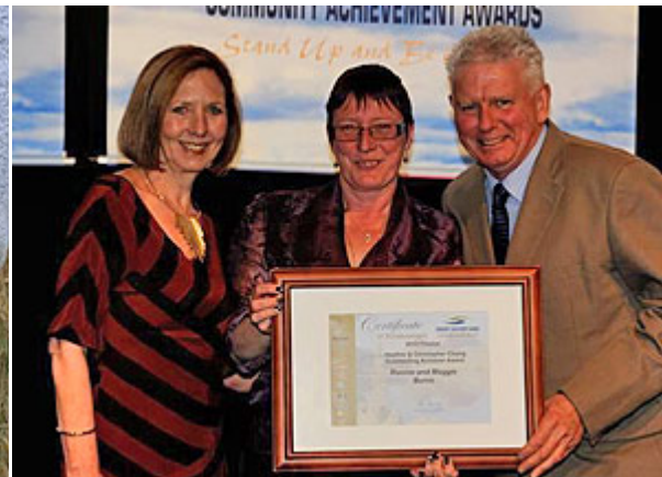
Community Achievement Award

"It is better to make changes for oneself than try to mend holes torn by the decisions and choices of others"